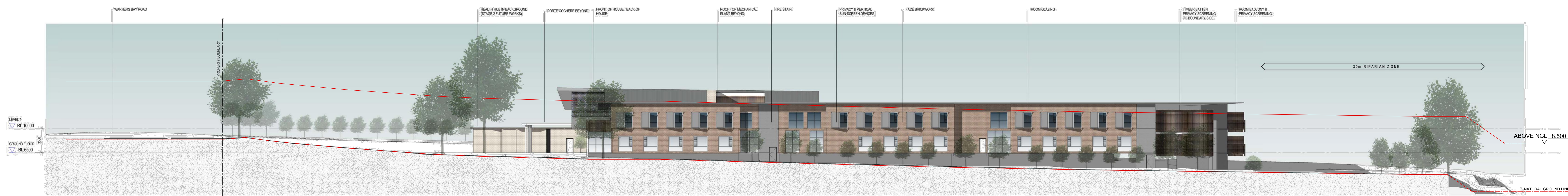
4 WEST ELEVATION