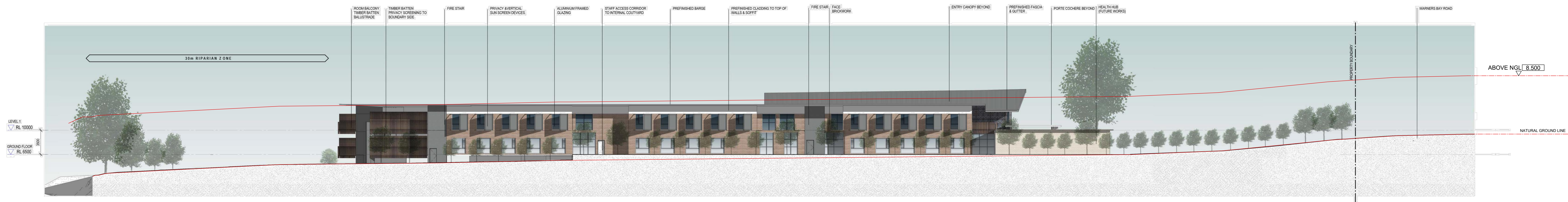
3 EAST ELEVATION